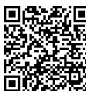
Employer First-Time Registration Manual (Chinese only)

After submitting the final application, employers can log in to the ER portal and enter "Employee Account Opening Status" to check the latest account opening status. For details, please visit our official website chinalife.com.hk and refer to the E-Enrollment User Manual or scan the QR code below for more information.