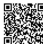
E-Enrollment User Manual (Chinese only)